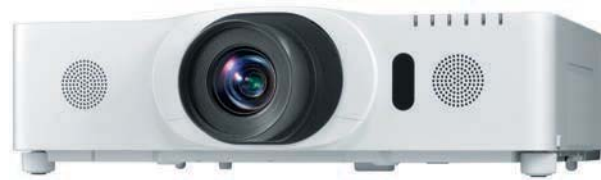
Front 3/4 View

wireless presentation compatible. Plus, embedded networking gives you the ability to manage and control multiple projectors over your LAN (scheduling of events, centralized reporting, image transfer, and e-mail alerts). Even with the array of advanced features, Hitachi's CP-WX8265 is designed for user-friendly operation and installation convenience.